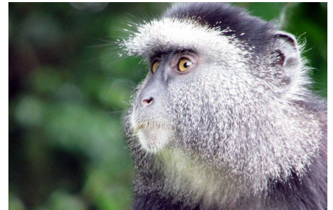
Blue Monkey: One of seven species of primates found in Kakamega forest that is threatened with extinction as the forest becomes smaller.